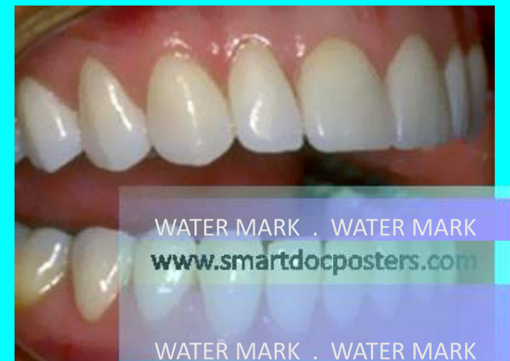
After Ceramic Veneering