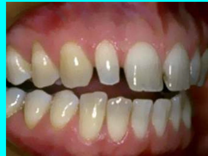
Spacing in teeth

These shells are bonded to the front of the teeth changing their COLOUR, SHAPE & SIZE